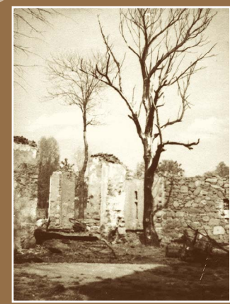
The ruins of the village and the mill a year after it had been burnt down (MM Skuteč)