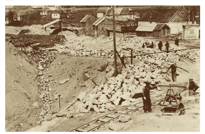
Ležáky was a village of poor miners

In a half-year period (from October 1941 to April 1942) there were operating 4 paratroops from England in close surroundings of the village of Ležáky including the village. They were called: Percentage, Silver A, Silver B and Intransitive. The tragedy of the village of Ležáky is closely connected with the Silver A paratroop, dropped together with both the Anthropoid paratroop and Silver B paratroop in the night of 28th to 29th December 1941 onto the territory of Bohemian and Moravian Protectorate. The paratroop consisted of first lieutenant Alfréd Bartoš, sergeant Josef Valčík and private Jiří Potůček. They all came here to set up a trasmitter called Libuše which should have enabled them to send the news from the Protectorate to London and help during sabotage activities. The regular raido connection between the Protectorate and Great Britain was in existence since 15th January 1942. The transmitter was operated by the families of resistence fighters, gendarmerie from Vrbatův Kostelec, other members of a resistence group Čenda as well as Fred Bartoš's helpers from Pardubice. Libuše was in operation in the nearby quarry Hluboká until May 1942, when it was transferred to Švanda's mill in Ležáky.