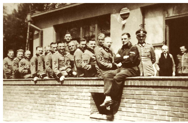
This is the photo of the members of ordinary police in the Chateau of Pardubice from 1942

Almost 37 people directly connected with the village of Ležáky and the mill were executed in Pardubice grounds.